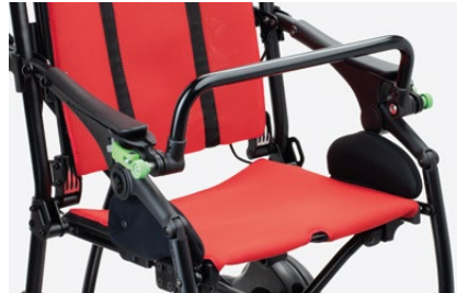
839 Front handlebar Adjustable in tilt. Easy to remove to fold the stroller.