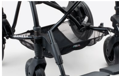
858 Shopping basket