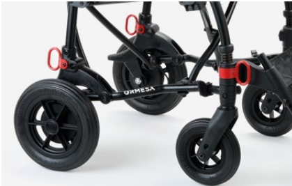
891 Set of 4 tie down hooks

It increases the total height of max. 7 cm/2,7 in (94-101 cm/37-39,7 in)