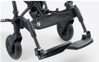
956 Footrests adjustable in tilt