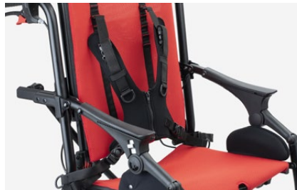
853 Vest harness with zipper