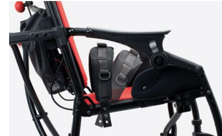
947 Pelvic belt with variable angle Available in two sizes.