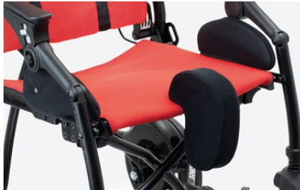
834N Padded abduction block removable. Available in two sizes.