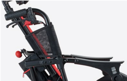
844 Padded side protection covers