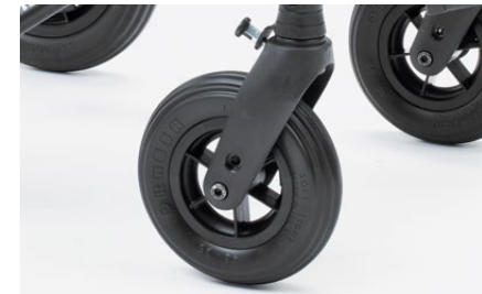
812 Front wheel directional locks