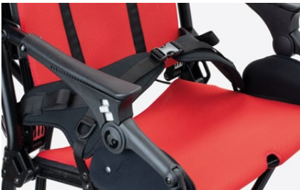
920 Four point pelvic belt Available in two sizes.