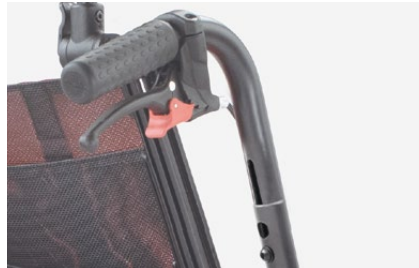
951 Height adjustable push handles

It increases the total height of max. 7 cm/2,7 in (94-101 cm/37-39,7 in)