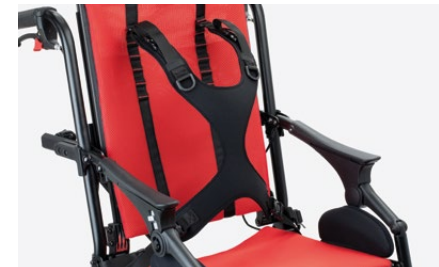
853 slim Four point shaped harness