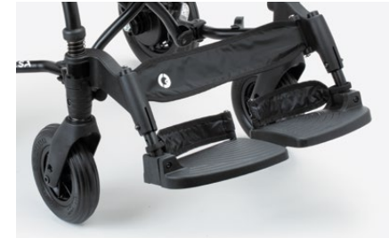
960 Heel rests