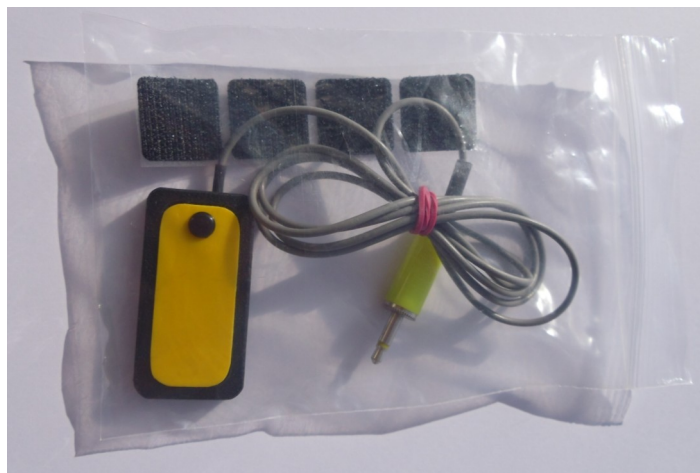
The Matrix HEADS FIRST Switch