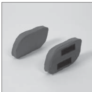
EE 37 Lateral pads