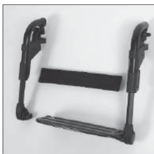
EB 05 Single-panel footrest