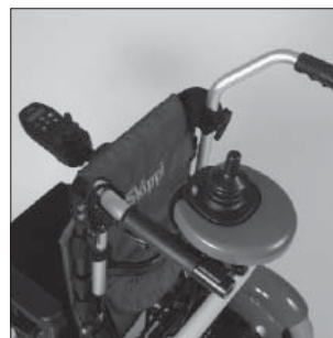
EU 15 Attendant control