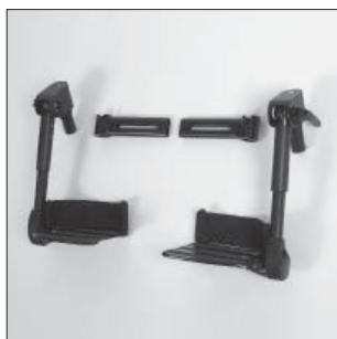
EB 20 Elevating footrest