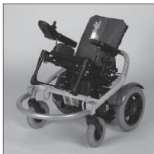
EC 50 Electric seat tilt