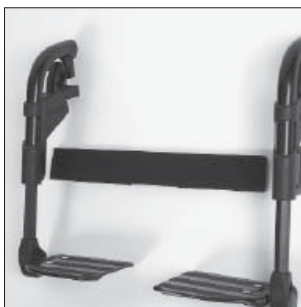
EB 02 Individual footrests