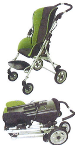
easily folded to a small unit that fits in the car boot

New improved functions as a fold-back footrest on the standard model makes it easier for children to switch seats, thereby increasing their active involvement in everyday situations! By way of an ergonomic improvement for the person in charge, PIXI is now also fitted with an adjustable-angle push-bar as standard. A new and improved, easy-to-operate foot brake with protective rubber coating is also one of the improvements on the new updated PIXI. You can choose between small or large PIXI and choose between two different seat depths with high or low back support.