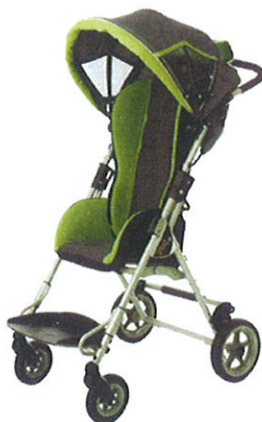
PIXI with a sunroof