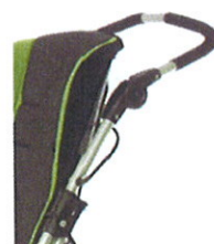
adjustable push handle