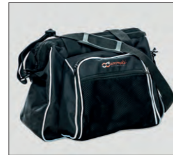
OMO_502 Bag DeLux