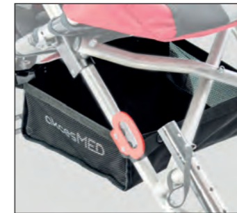
OMO_505 Under seat storage basket