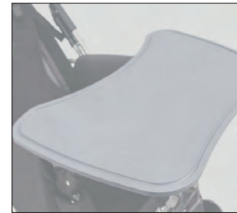
OMO_403 Tray PU