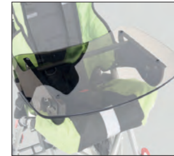
OMO_414 Tray Plexiglas®