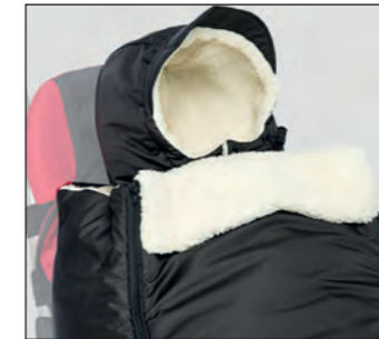
OMO_418 Hood for winter footmuff