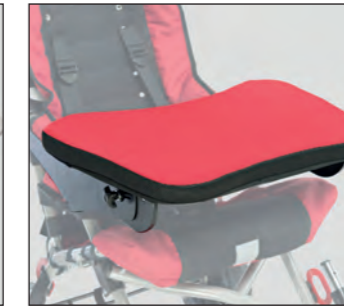
OMO_003 Soft cover for tray