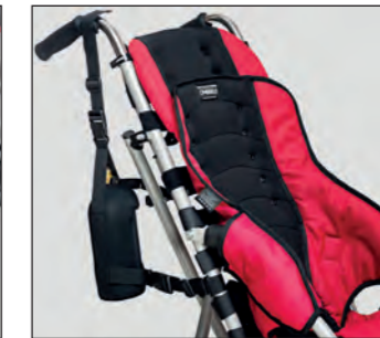
OMO_507 Oxygen tank holder