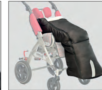
OMO_417 Winter footmuff