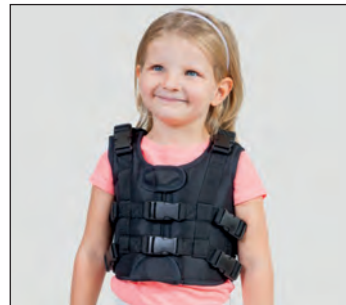
OMO_125 6 point safety vest