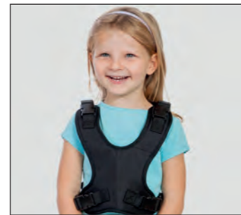
OMO_130 4 point safety vest