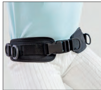
OMO_107 Pelvic belt