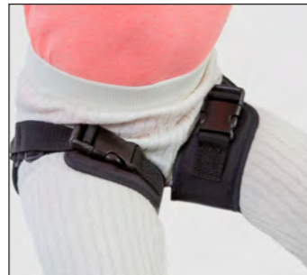
OMO_101 Thigh abduction belts