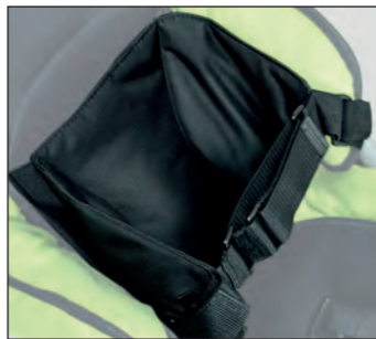
OMO_113 Trunk stabilizing belt