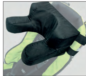
OMO_121 Head-neck support