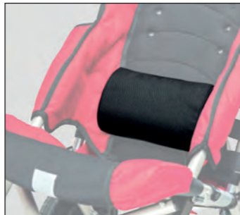
OMO_124 Lumbar support