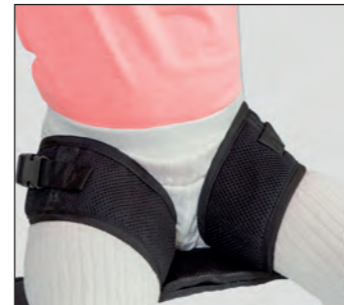
OMO_129 Abduction/adduction thigh belts