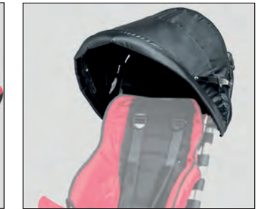
OMO_405 Folding canopy