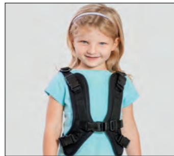
OMO_114 H Harness