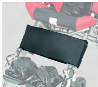
OMO_115 Calf belt