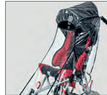
OMO_408 Rain cover