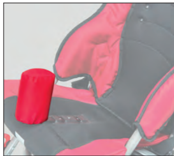
OMO_128 Abduction block