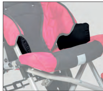
OMO_135 Side seat support