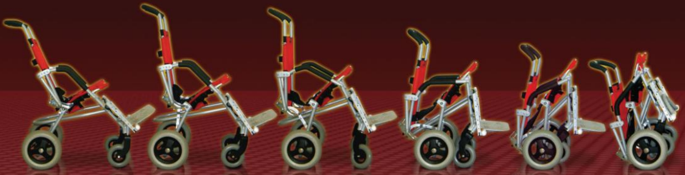
Simple and unique folding mechanism