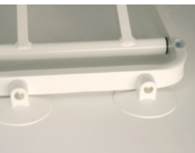
Four large suction cups provide for a solid grip