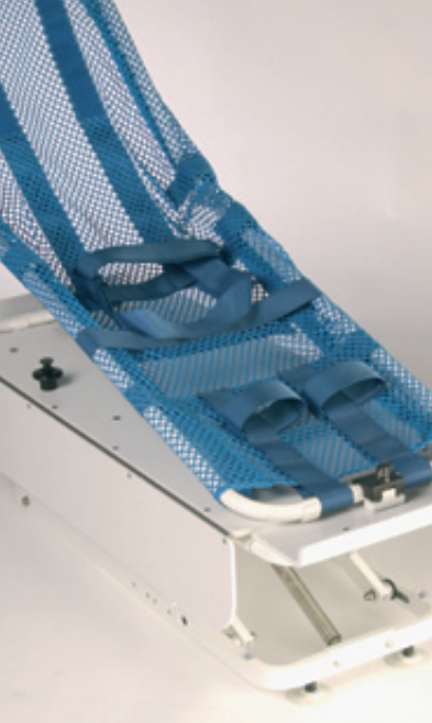
Flipper attached to the Hubfix II