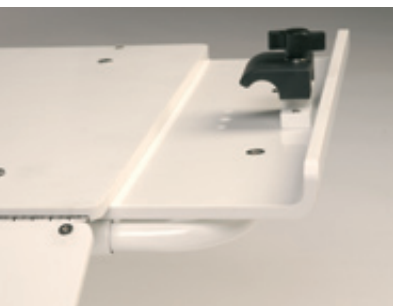
Telescoping cover panel, attachment