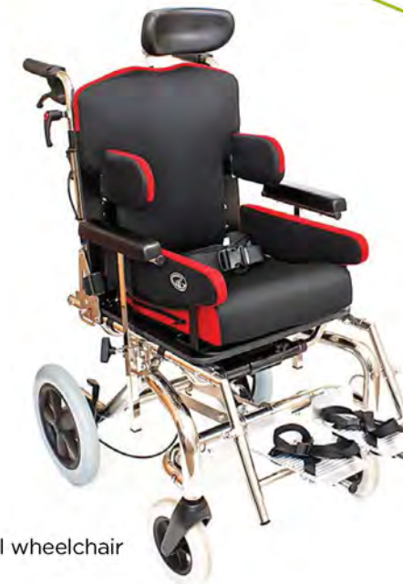
Gill 2 fitted to Neo manual wheelchair