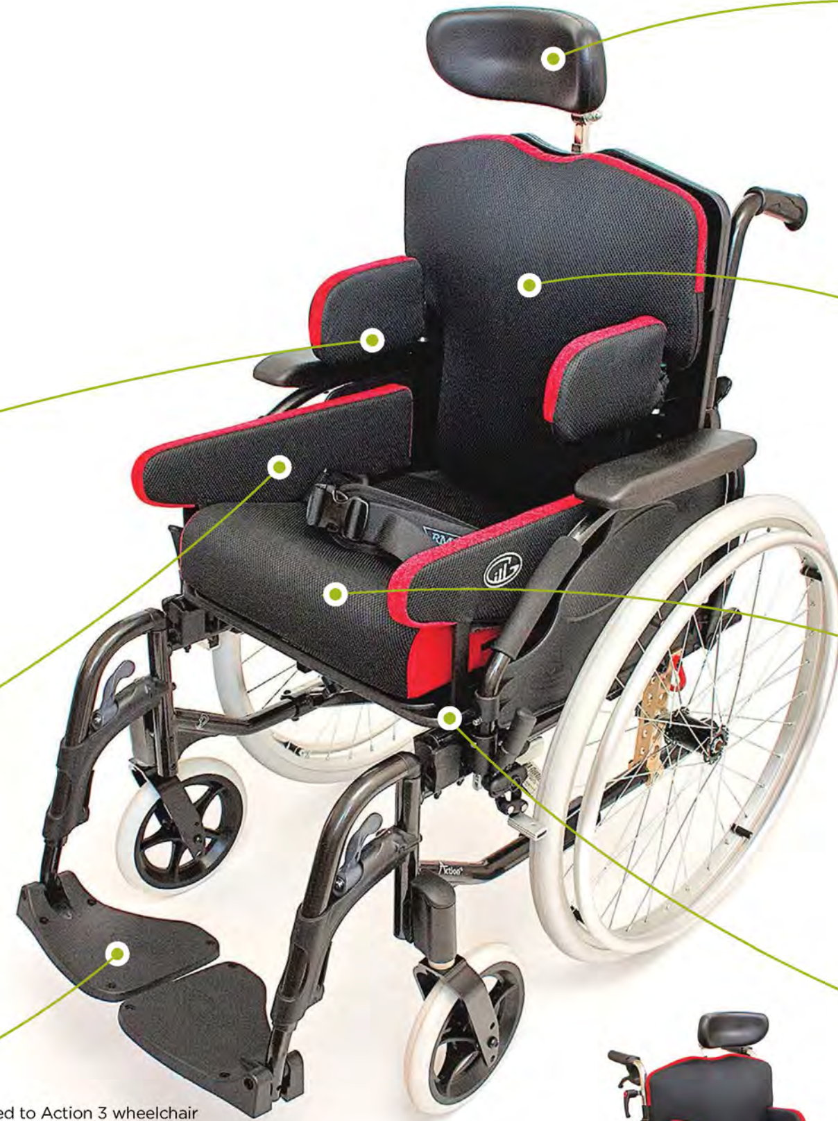
Gill 2 fitted to Action 3 wheelchair

The Gill 2 uses the footplates from the host wheelchair.