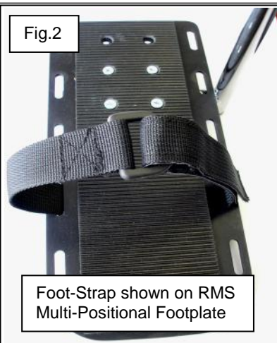
Foot-Strap shown on RMS Multi-Positional Footplate

• Care should be taken not to over-tighten Foot-Straps when adjusting.