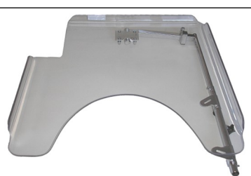
Tray with 1/3 Comfort Pad