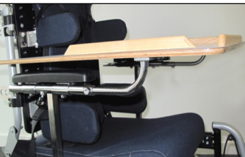
Plywood / Laminate Tray with Swing-over style Frame