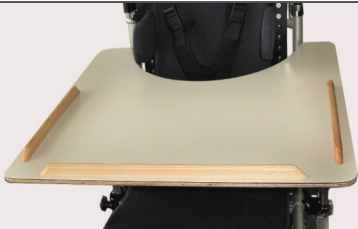
Plywood / Laminate Tray with Width-adjustable Slide-in Stems