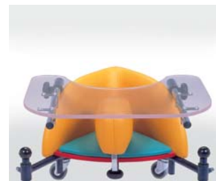
824 - transparent table

BIRILLO safeness is in compliance with the 93/42 European Directive :