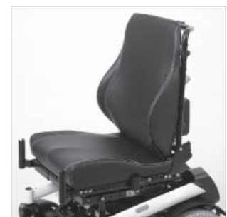
EC 24 Contour seat with deep contours EC 26 Synthetic leather cover

The number codes contained in this order form are not intended to be used as article numbers for spare parts orders. Please use the spare parts catalogue for spare parts orders.