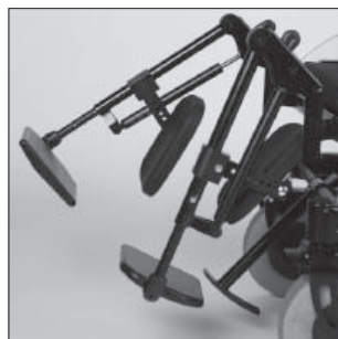
EB 20 Mechanical footrests