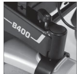
EF 03 Mechanical caster wheel swivel lock