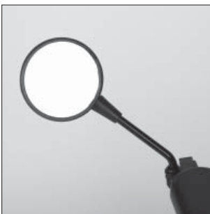
ES 38 Rear-view mirror