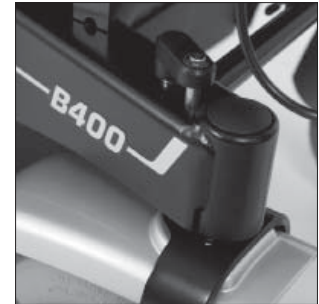
EF 03 Mechanical caster wheel swivel lock