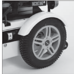
EA 10 Splash guard, complete