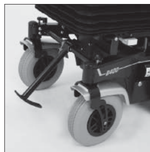
EF 04 Curb climbing assist