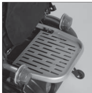
ES 42 Luggage carrier