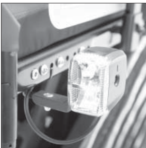
ES 05 Electric lighting for road traffic