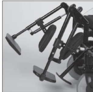
EB 20 Mechanical footrests