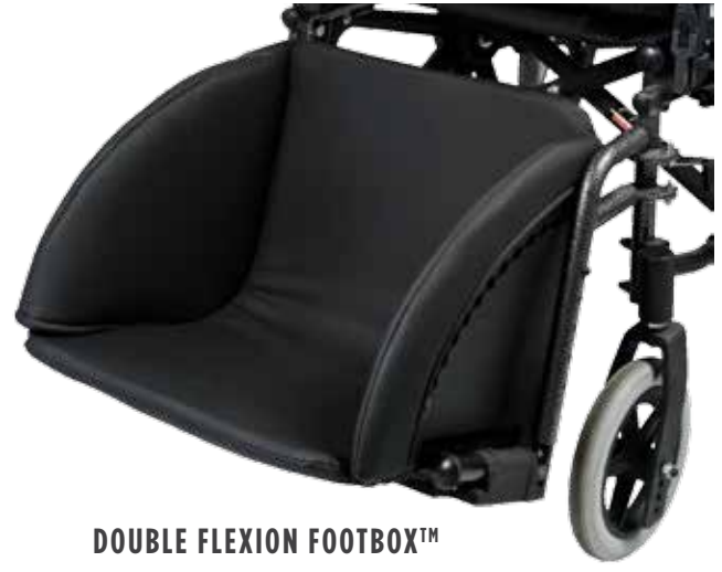
DOUBLE FLEXION FOOTBOX™