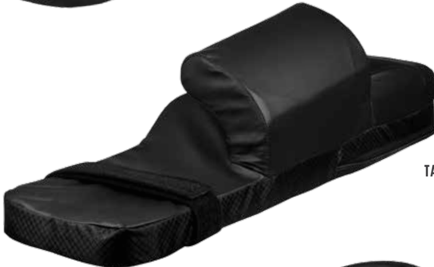
TALL RAIL ARM