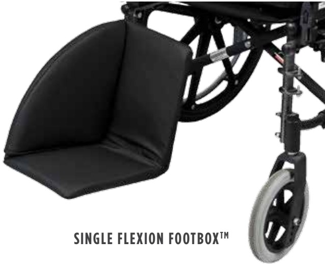
SINGLE FLEXION FOOTBOX™