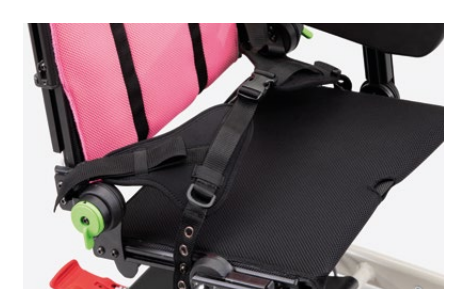
920 Four point pelvic belt Available in two sizes.