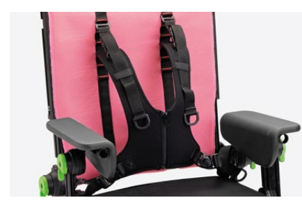
853 Vest harness with zipper Available in two sizes.