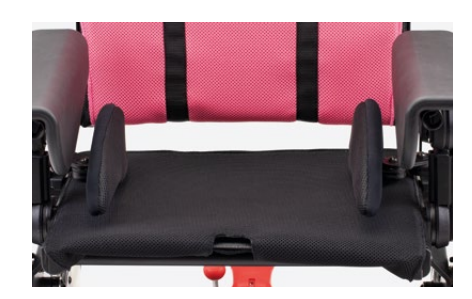
958R Padded pelvic side supports Adjustable in width, rotation and depth.