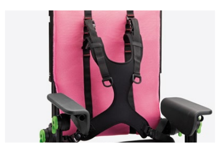
853 slim Four point shaped harness