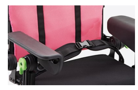
947 Pelvic belt with variable angle Available in three sizes.