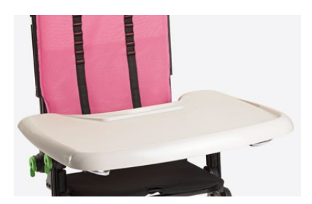
824 Tray with wrap-around recess Adjustable in depth, height and tilt with armrests.

It is made of resistant and hygiene material, no edge design, it does not retain any residue of food.