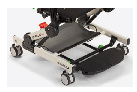
959 Set of 4 wheels with brakes as an alternative to the 4 black glides. 75 mm swivel wheels all equipped with brakes. Supplied with footrest.

For easy transport and storage. Allows the transfer even with the child seated.