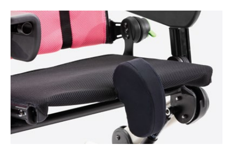
834N Narrow abduction block Available in two sizes